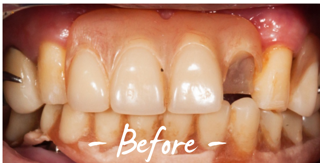
- Before -