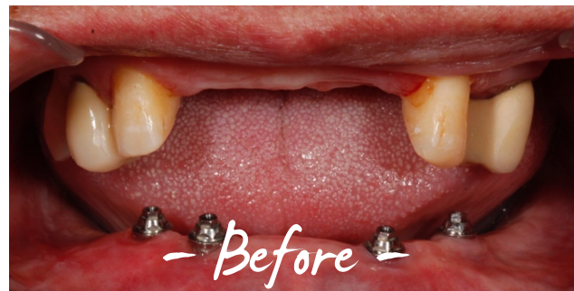
- Before -

"Will" was referred to me because the general dentist did not feel comfortable restoring the lower osseointegrated implants with a full arch implant prosthesis against an upper partial denture.