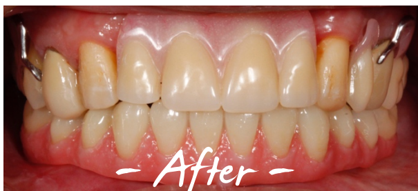
- After -